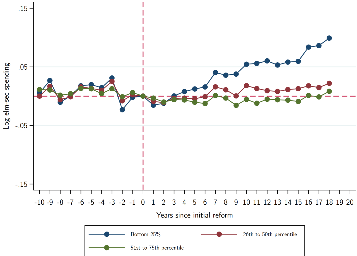
Figure A4: This figure shows an event study graph of the change in elementary-secondary school spending before and after court-mandated school finance reforms that occurred between 1995 and 2010. The event time indicators are interacted with the base year spending quartiles. Each series represents the difference in the log of elementary-secondary school spending in the associate quartile compared to the omitted category (the highest-spending quartile) before and after the reforms. This specification includes log enrollment, year-fixed effects, and district-fixed effects. Data source for school finance reforms: ?.